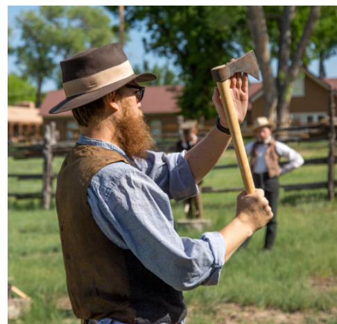
ABOVE: A member of Philmont’s interpretive staff gets into character.