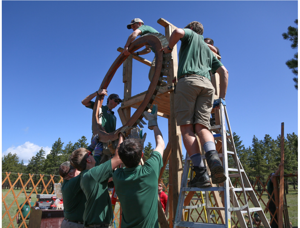
ABOVE: Staffers work together to place the “ring of death” that stabilizes the yurt.

The yurts serve as the main structure in each camp. While other Philmont camps have cabins, the Valle Vidal area is different. Philmont’s land use agreement with the