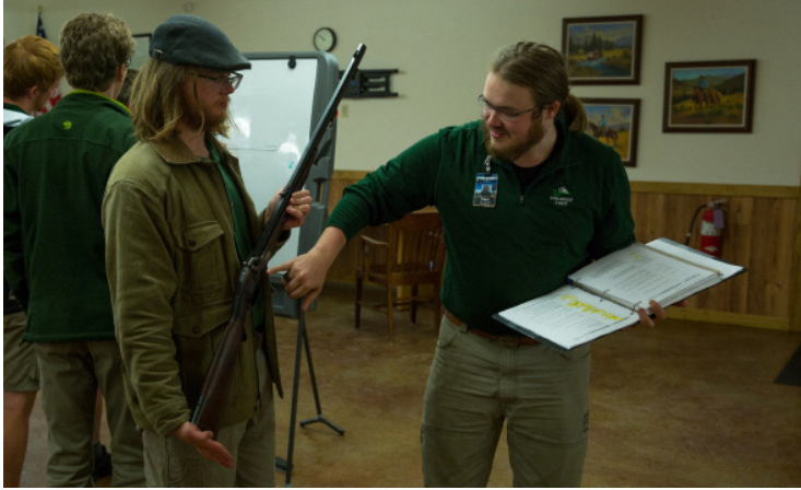
ABOVE: A staff members practices handling on of the firearms.