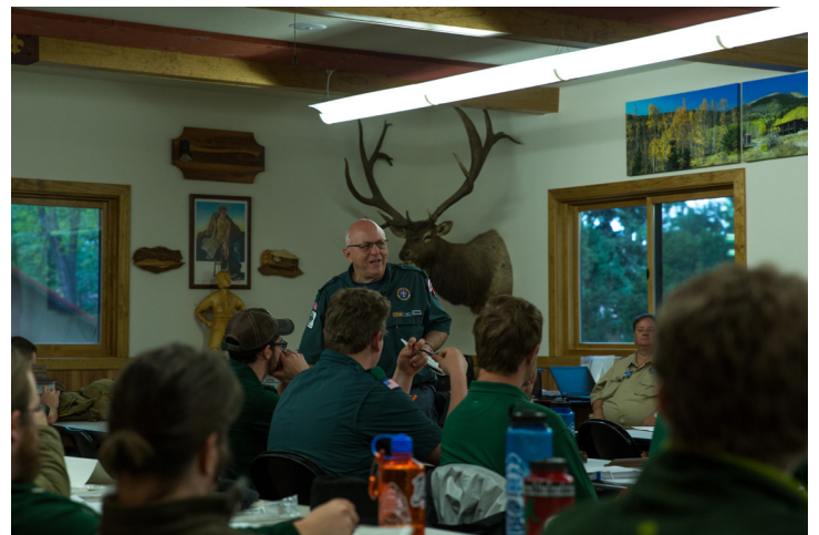
ABOVE: A shooting instructor explains the NRA guide course.

You can join by visiting the PSA Office, next door to the National Scouting Museum (Office hours 8am-5pm Monday-Friday & Sunday 1pm-5pm) or join online: www.philstaff.org