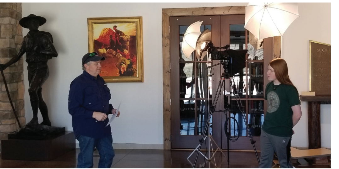
National Scouting Museum and Philmont staff members on set preparing a documentary on the history of Scouting. Note, this was filmed before COVID-19 and the Philmont wide use of facemasks.

Currently the staff is working on a variety of digital assets to help tell the story of the BSA and share the artifacts of the NSM with Scouts and Scouters around the world. While these resources will not replace a personal visit to the NSM, they certainly will provide you with an opportunity to learn more about the rich history of the BSA and our positive contributions to society.