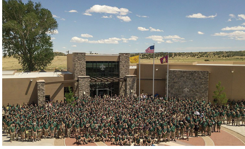
The National Scouting Museum opened its doors to the public in May 2018. Pictured are the 2018 Philmont summer seasonal staff in front of the completed facility.

The National Scouting Museum's Philmont home will be the primary place to see Scouting memorabilia, but the BSA's expansive collection of Scouting collectibles will be spread far and wide. Additionally,