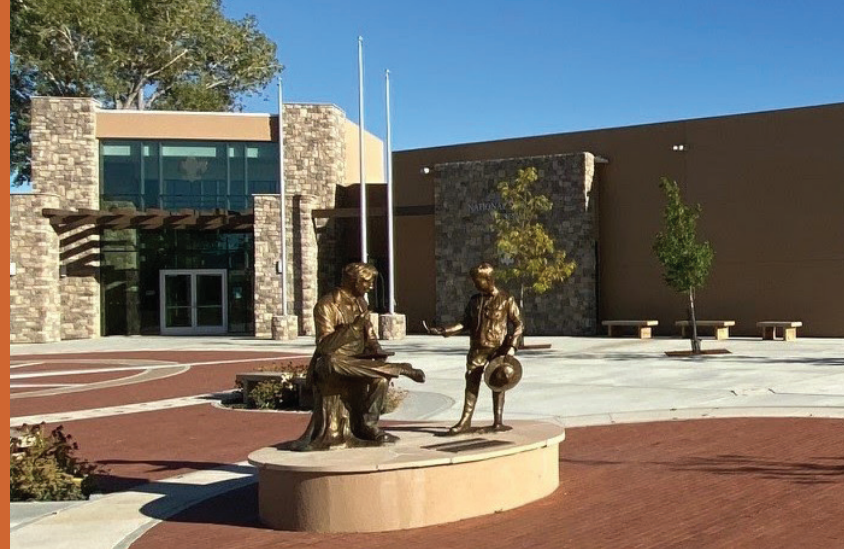
Bricks purchased will be placed surrounding the "Wonder of Discovery" monument at the entrance of the National Scouting Museum.