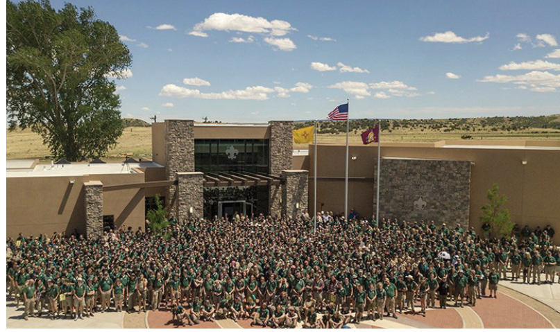
The National Scouting Museum opened its doors to the public in May 2018. Pictured are the 2018 Philmont summer seasonal staff in front of the completed facility.

The National Scouting Museum's Philmont home will be the primary place to see Scouting memorabilia, but the BSA's expansive collection of Scouting collectibles will be spread far and wide. Additionally,