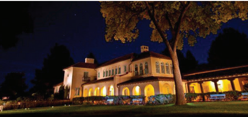
Waite Phillips built the VILLA PHILMONTE as the home for his family on the Philmont Ranch. It was completed in 1927 and was designed in Spanish Mediterranean style. Restored to the period when Phillips owned the ranch, it now serves as a memorial to him and his generosity to the Boy Scouts of America.

Camping gear, uniforms, service projects and more tell the story of Scouting in Exhibit Hall A. The history of Philmont Scout Ranch and the Great Southwest fill Exhibit Hall B. Study the ranch's trails on an over-sized topographical map, watch an old mud wagon undergo on-site restoration and view priceless pieces of pottery and art work of Ernest Thompson Seton.