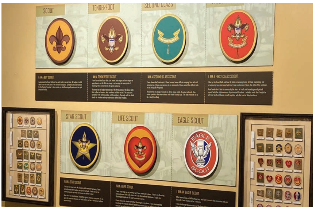
NSM staff installed a new rank display showcasing the various designs from Scout to Eagle Scout.