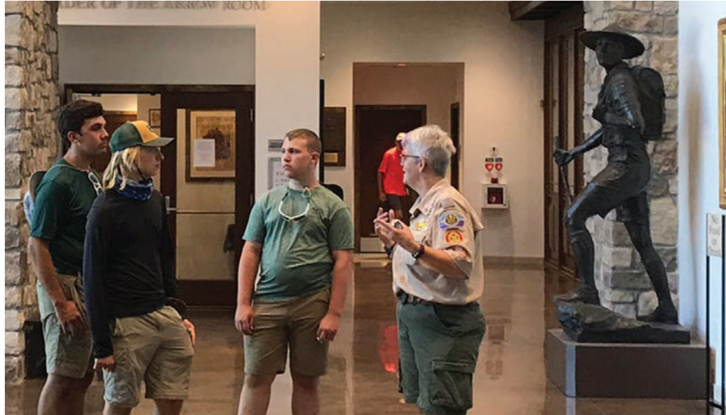
A Volunteer Docent greets visitors to the NSM during the summer of 2019. More than 31,000 people stopped by the NSM in 2019. Docents are vital to helping us deliver an excellent experience to each individual guest.