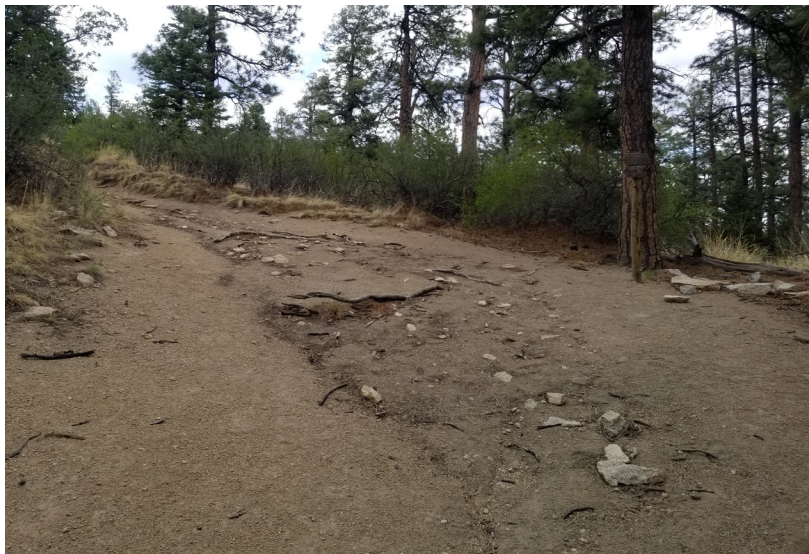
Wire Fence Switchback - 6.39