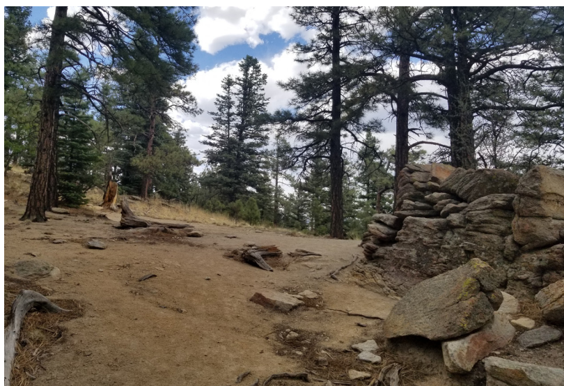
Finish Line (You Made it Gate) - 7.96