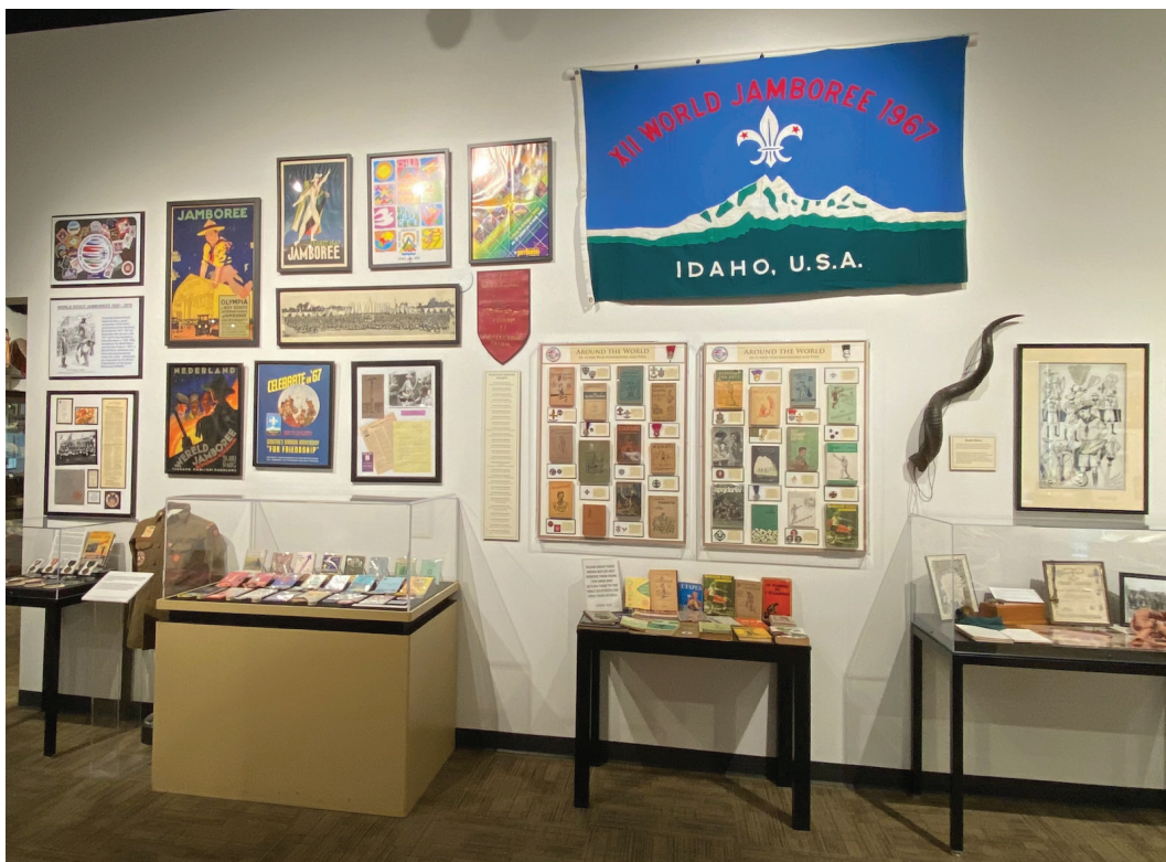
A temporary exhibit at the National Scouting Museum focused on the World Scout Jamborees.

Each of these galleries will have its own