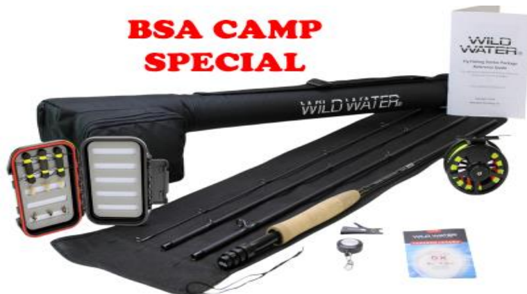
Wild Water Complete 9' - 5/6 wt. Pack Rod Kit w/ Case/ Fly Box w/ 9 Flies/ plus Tools for $85.00

Optional for both courses: CAI Gear Pricing COMPLETE FLY FISHING STARTER PACKAGE