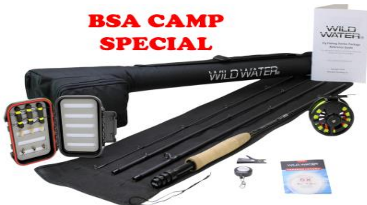
Wild Water Complete 9' - 5/6 wt. Pack Rod Kit w/ Case/ Fly Box w/ 9 Flies/ plus Tools for $85.00

Optional for both courses: CAI Gear Pricing COMPLETE FLY FISHING STARTER PACKAGE