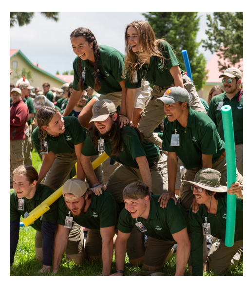
2024 PTC having fun and bring enthusiasm at All Staff Day