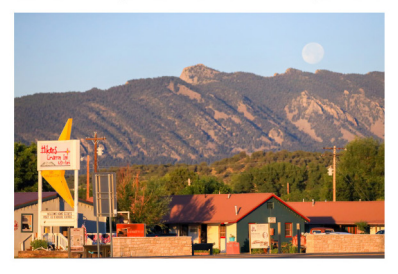
CLEAN ROOMS, FRIENDLY VIBES YOUR TRAILHEAD TO COMFORT!