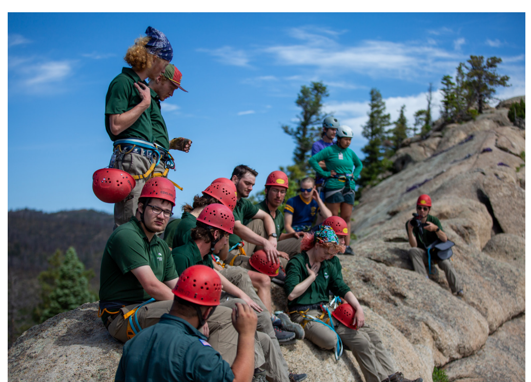
2024 Rock climbing Training at Cimarrocito