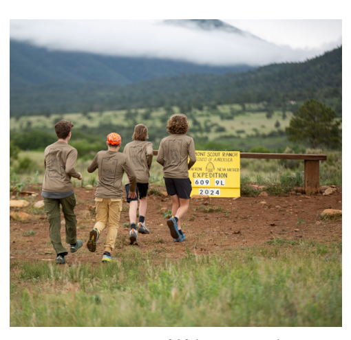
2024 crew running to get their crew photo taken.

Work hard this week to learn your roles, how you can bring success to your department, and what you can do to give each participant a great, life-changing Philmont experience. This summer is a growth opportunity for us all. And who knows, maybe your lives will be changed forever as well! Thank you for the work you will do this summer across the Ranch, and I look forward to seeing you all in action very soon.