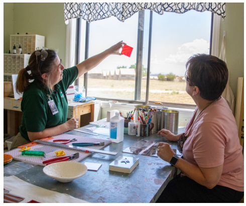
2024 PTC Craft Center

We can't wait to see you this summer — whether it's for a week of training, a family adventure, or just a visit to join in the fun. See you soon!