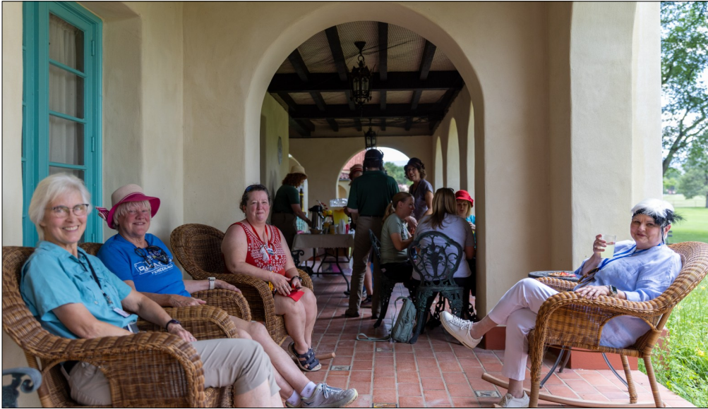
Silverados enjoy a 1920's tea party on the veranda of the Villa Philmonte.