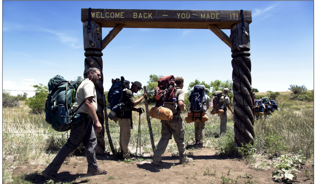
Adult advisors need to let the Crew Leader be in charge. They are there to support them and ensure the safety of the participants for a successful Trek.

youth leaders guide the experience and to step in only when there is a health and safety concern?