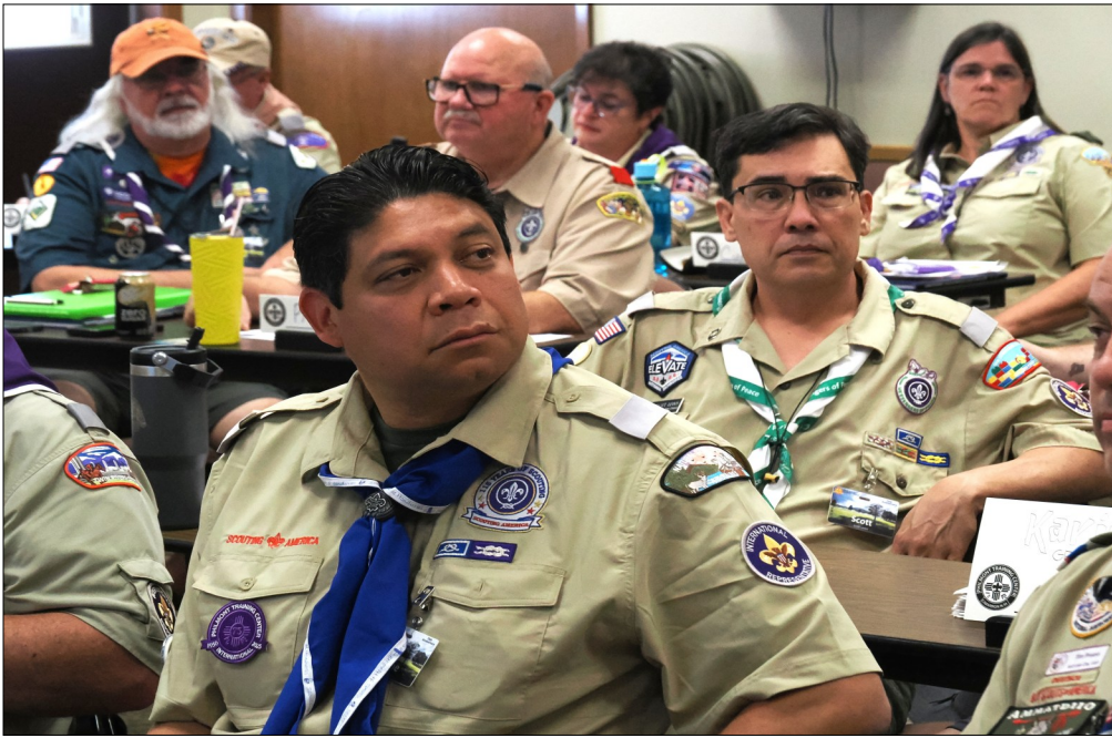
Scouters from around the country benefit from participating in one of PTC's conferences. Not only do they hear from national experts, but they get to interact with other participants both in and out of the classroom.