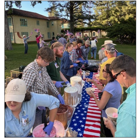
An ice cream social is one of the highlights of the week at Philmont Training Center.

Bring your family and share the adventure. Philmont is a place for everyone, and families are welcome and encouraged to attend. Whether discovering history in