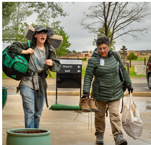
Staff Check-in, Photo by Matt Stepp

Plan your day. Use your resources. Enjoy where you are. Embrace community. For the millionth time today, Welcome HOme!