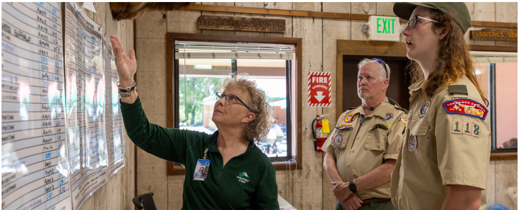
Logistics 2025