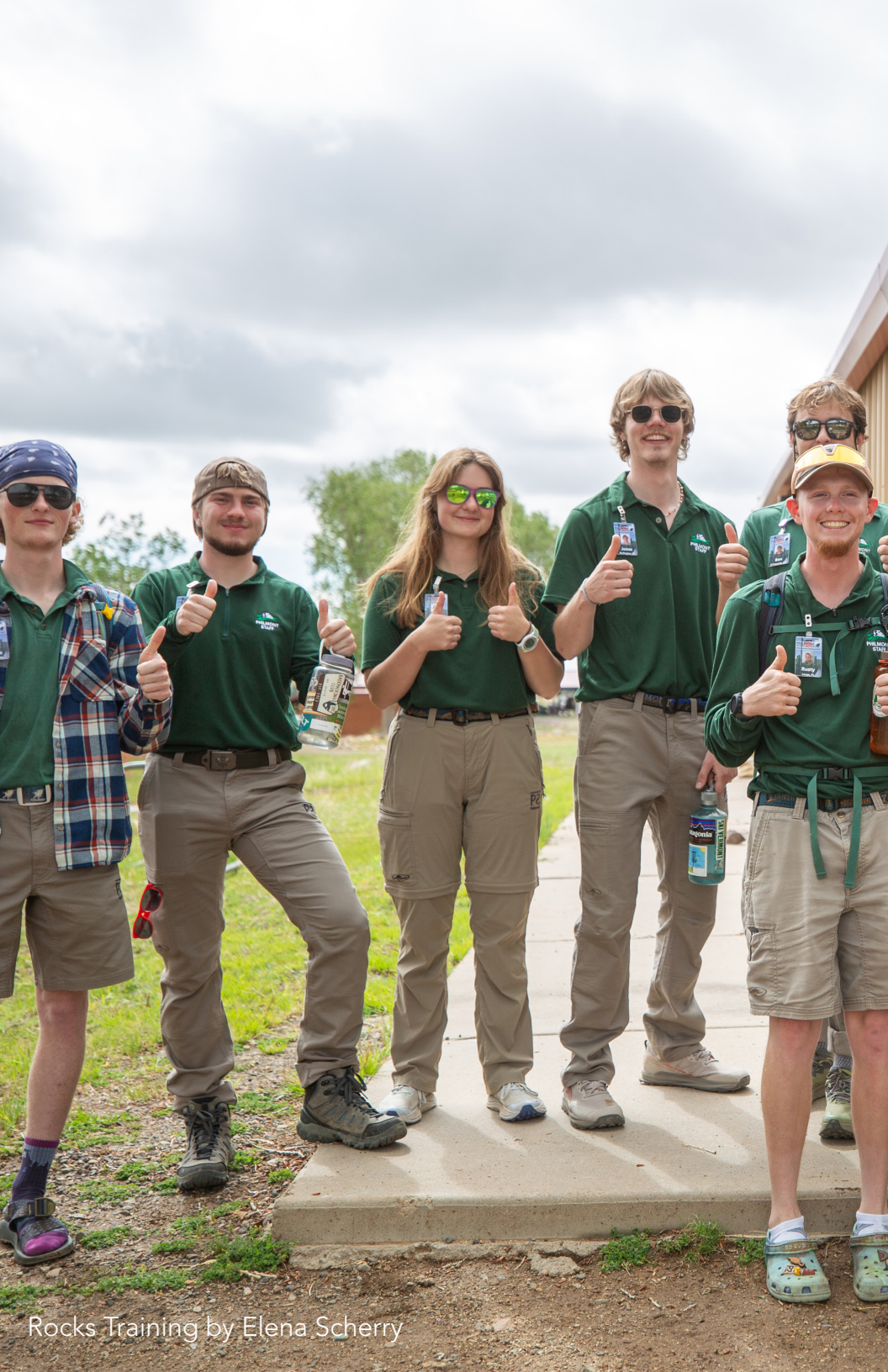
Rocks Training by Elena Scherry