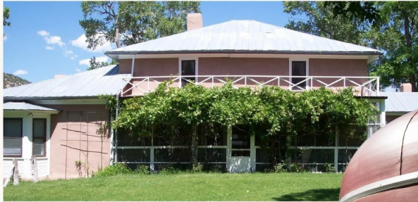
Chase Ranch Main House Museum