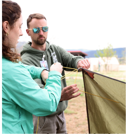
Ranger Training