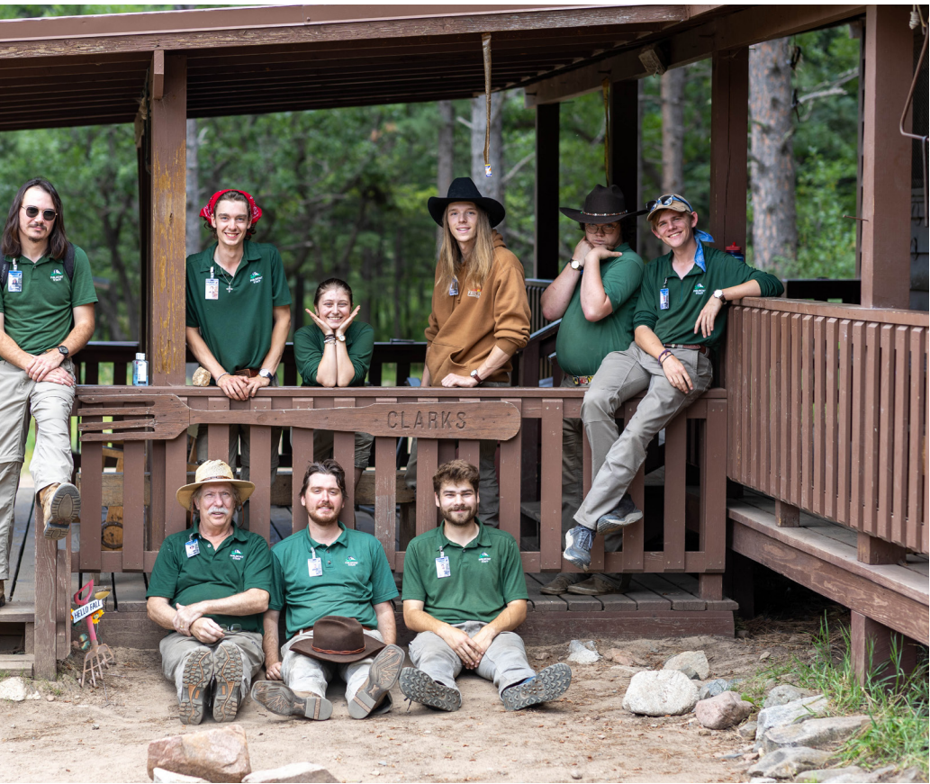
Clarks Fork Staff 2025