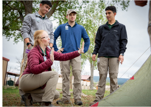
Ranger Training

delivery of the finest Scouting possible through backcountry adventure. In doing so I am sure you will find that it will not just change the lives of the participants but also change your own. Change Lives!