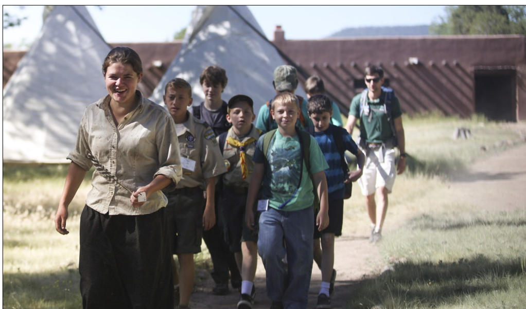
The Philmont Master Plan process is looking at how key aspects of the Ranch will operate for the long-term future for generations of Scouts.