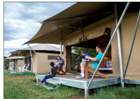
Deluxe Family Tents can accommodate up to six with a queen bed for adults and bunks for youth.