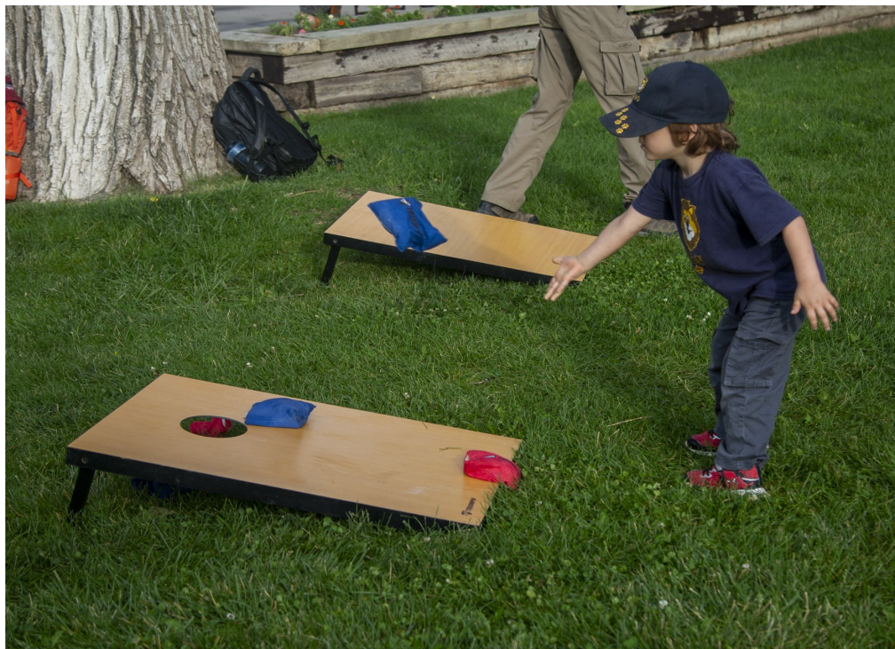
There is plenty of special activities for families with Cub Scouts during the last week of July at PTC.

The Founder's Ride, August 21-26 , lets you relive the joy that Waite Phillips found riding his horse through the backcountry. Upscale meals and social hours are just part of the experience. www.philmontscoutranch.org/ptc/founders-ride/