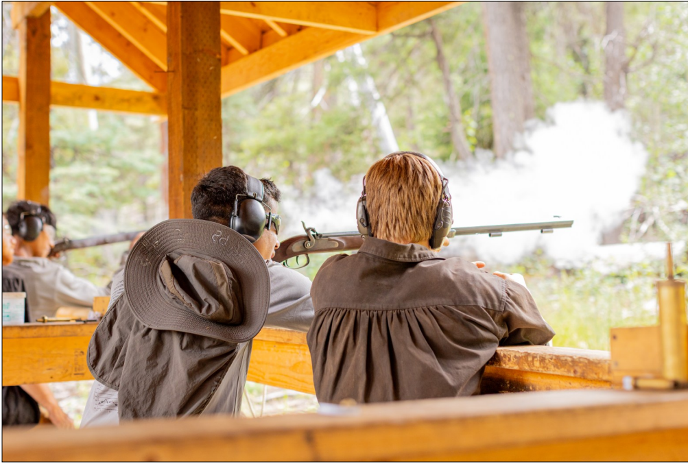
Range and Target Activities are among the most popular backcountry programs. This summer nearly every crew got its first choice of itineraries.