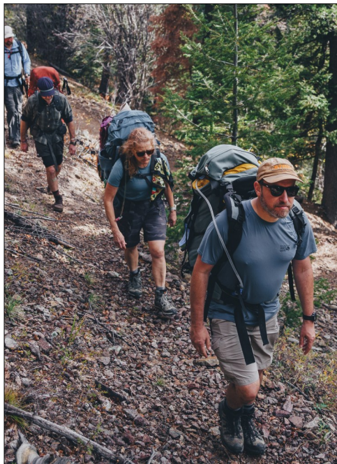
During the Autumn Adventure, you can enjoy mild days and cool nights on the trails while trading stories and sharing experiences.