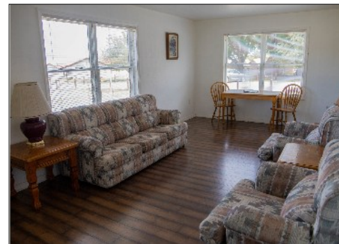
Some roofed housing offers comfortable resort-like arrangements.