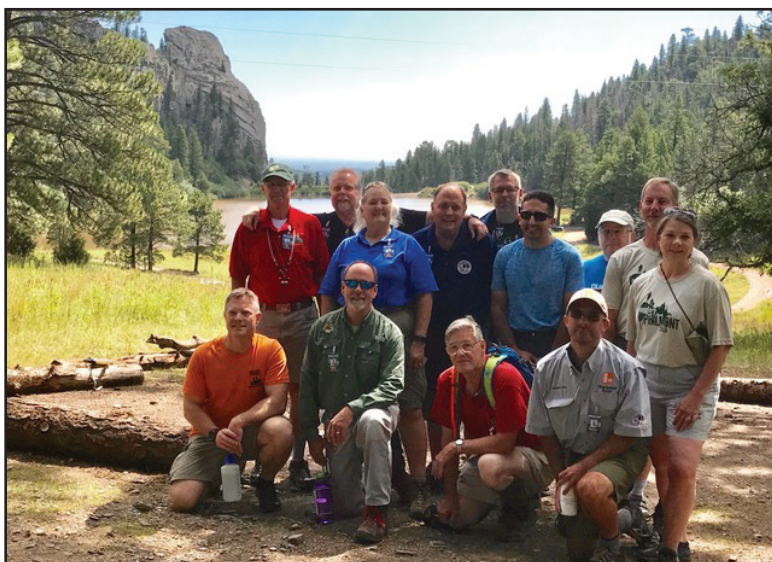
2017 Ambassador Seminar participants on back country tour at Cathedral Rock

a current, approved Philmont Ambassador and have completed the Ambassador Seminar I to attend.