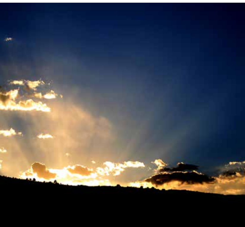
Sun setting in the west on Friday, June 20.