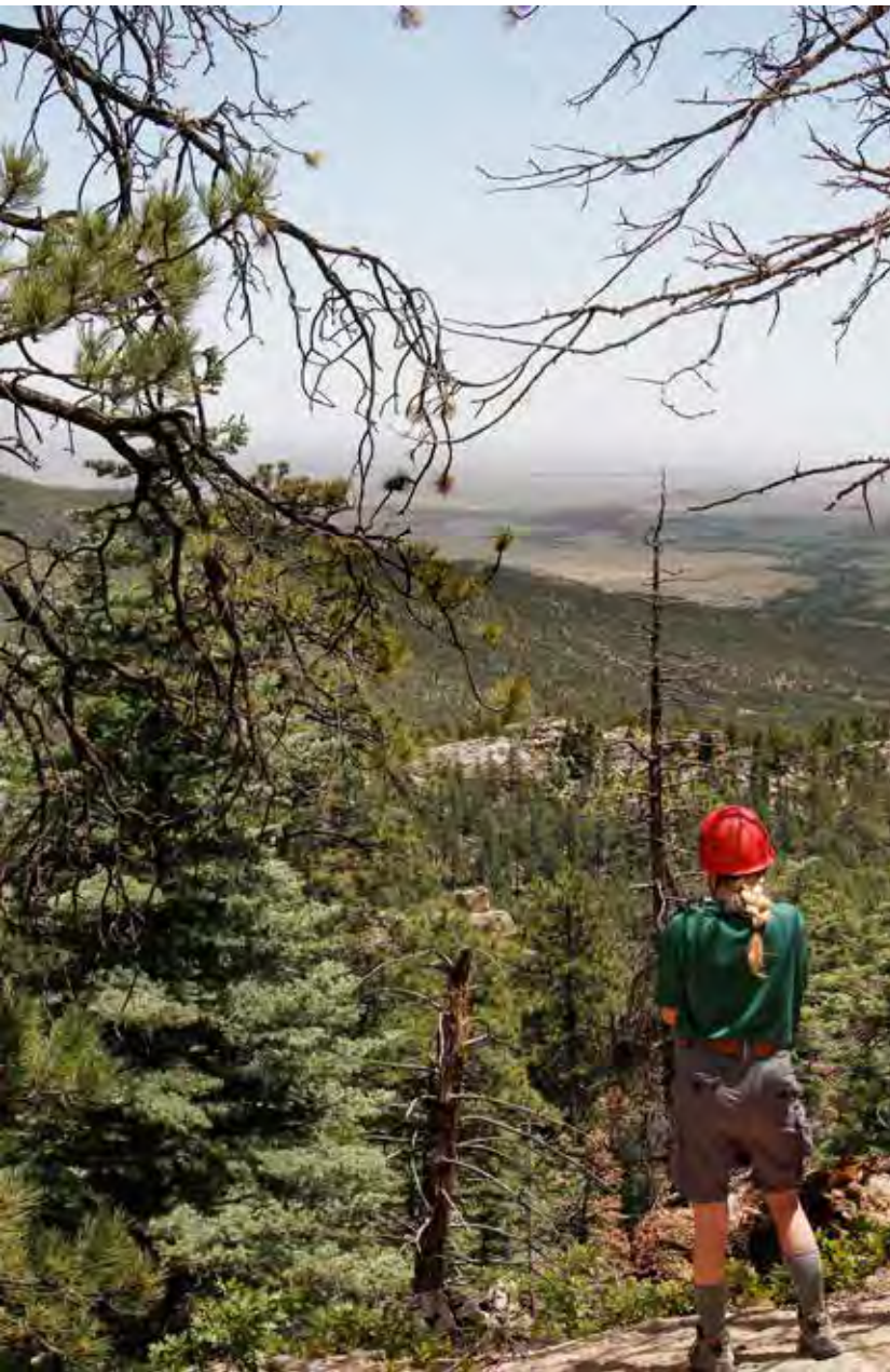
A Philmont staffer enjoys the view from Cimarroncito.