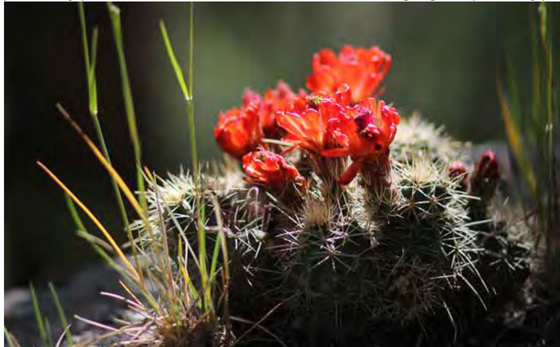
A cactus found near Miners Park.