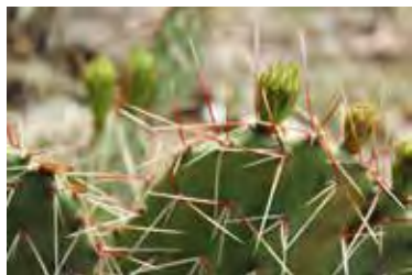
Opuntia fragilis , or Prickly Pear Cactus

Yellow flowers bloom from the fruit and span up to three inches in late spring to early summer. The petals are occasionally tinted red. Each flower lives for one day, opening at sunrise and closing at midday when the heat becomes unbearable. Seeing a flower in full bloom is a rare and lucky occasion, but don't get too close. The flower may be enthralling, but the thorns are painful.