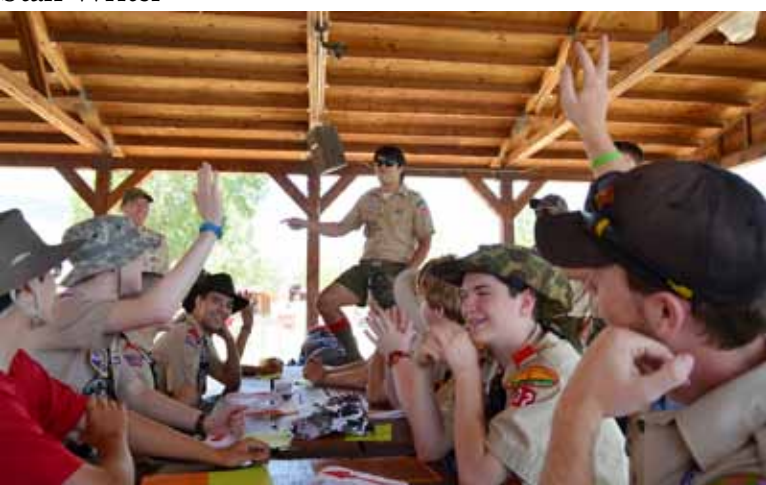
The first crew for the 2012 season arrives on Thursday, June 8.

A bus lopes on to the dirt road before the Welcome Center on a sandy Thursday afternoon, panting to a stop with a capitulating snort of gas and vapor. Her flanks are caked with the grit of a long drive; the Red Carpet Charter on her side barely legible through the muck. Within, she carries the first batch of arrivals.