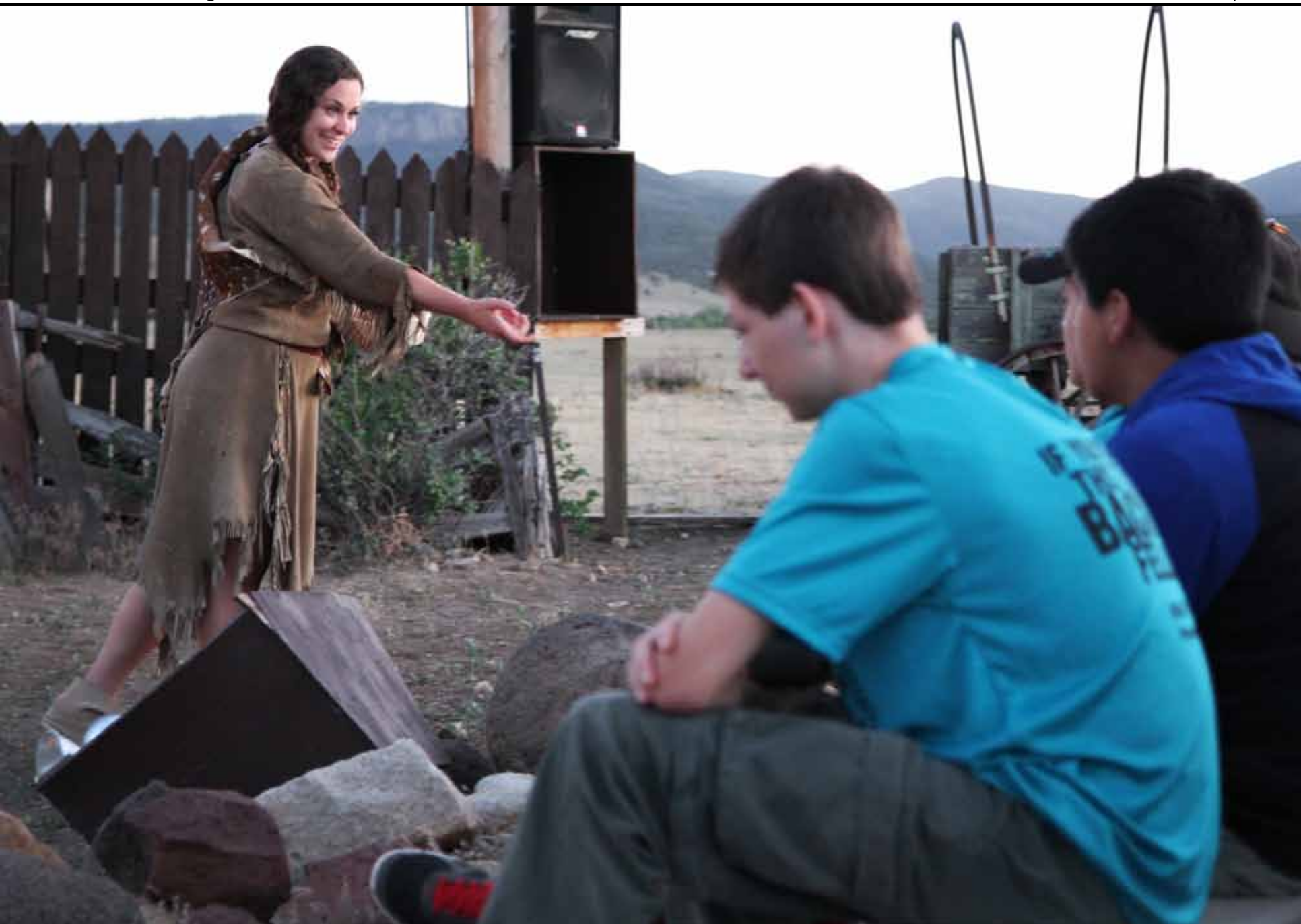
A staff member plays the role of a Native American who used to live on the land that is now Philmont Scout Ranch. Several actors and actresses performed monologues about the history of Philmont at the opening campfires on Saturday, June 9, at the Opening Campfire pit.