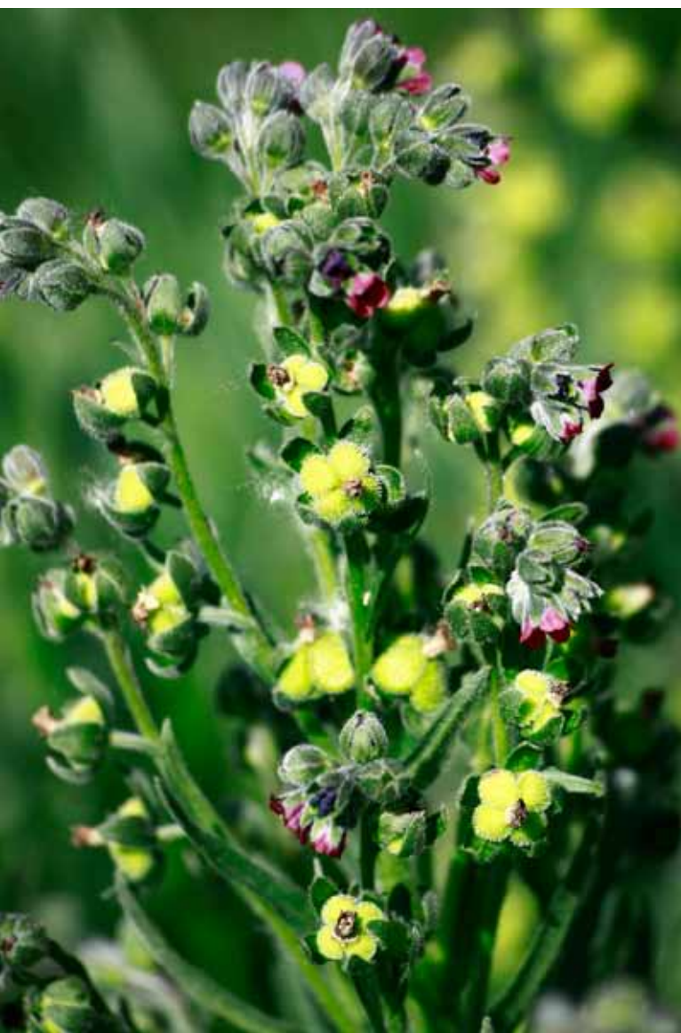
Hound's Tongue grows in Base Camp. This plant smells like buttered popcorn.