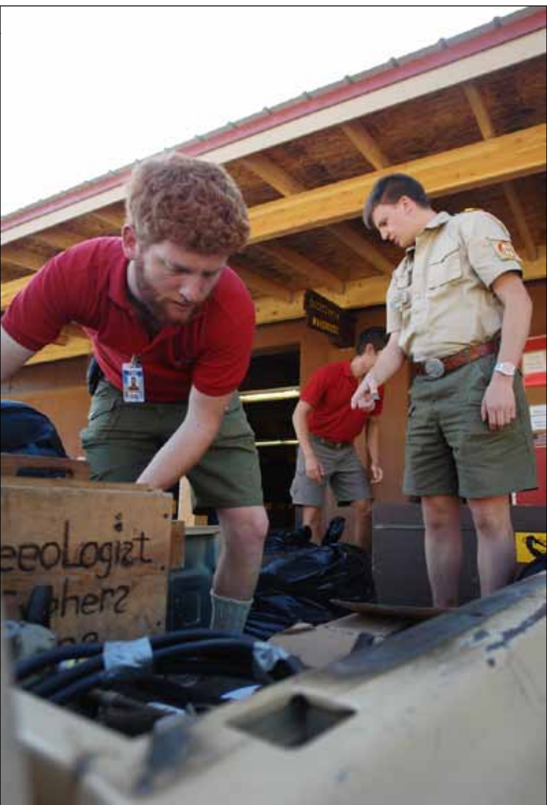
Crews load up a truck at base camp before Cypher's Mine scatter on Wednesday, June 6.