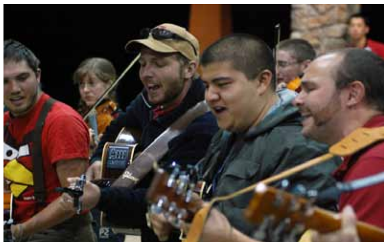
Philmont staff members play traditional bluegrass songs during a jam at the SSSAC on Monday, May 28.

Music is so powerful among the human race that we study it