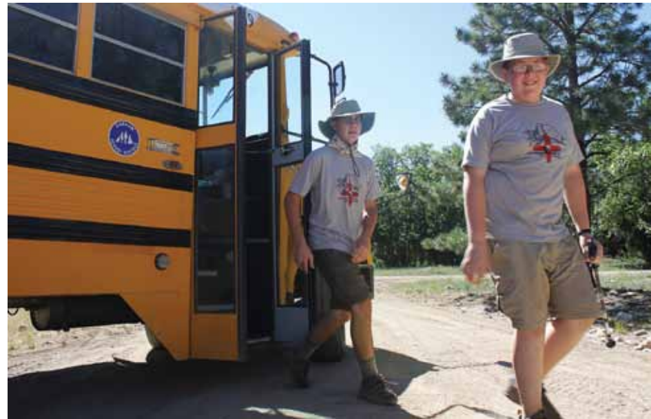
An arriving crew begins their adventure at Cimarroncito Turnaround.