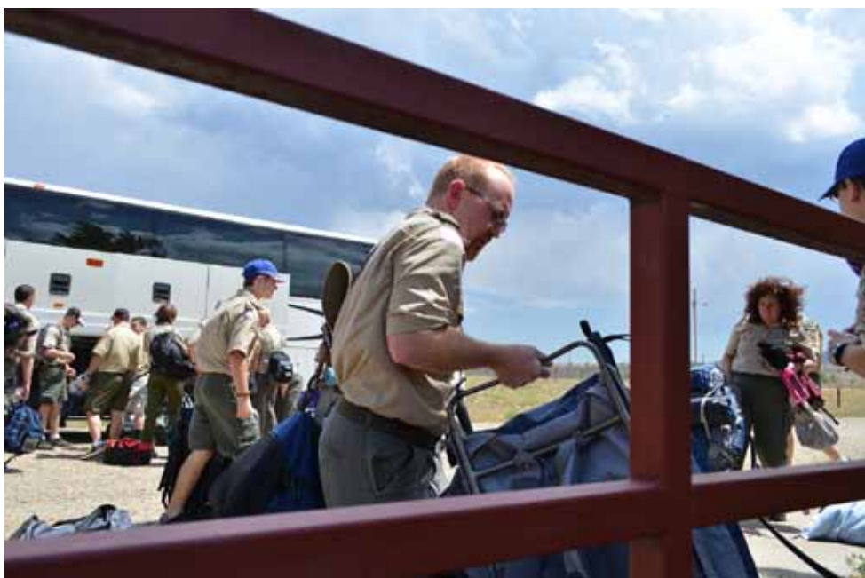
Expedition 608 V4 is the first traditional crew to arrive at Philmont on Thursday, June 7.