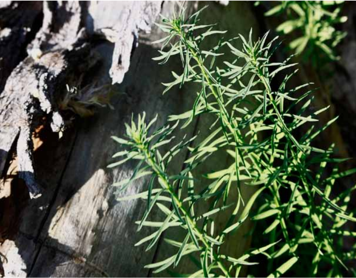
Yellow toad flax grows in Base Camp. This plant later grows yellow flowers.