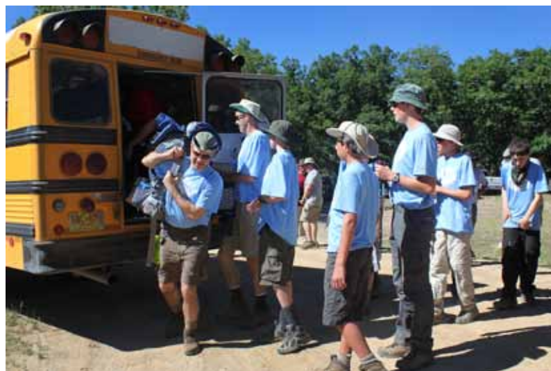
An arriving crew begins their adventure at Cimarroncito Turnaround.