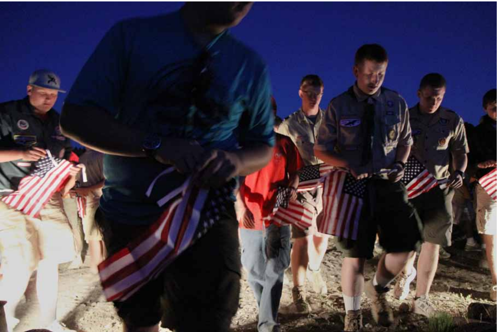
Crew leaders receive American flags from their troop rangers to symbolize their leadership of their crew at the opening campfire on Saturday, June 9.