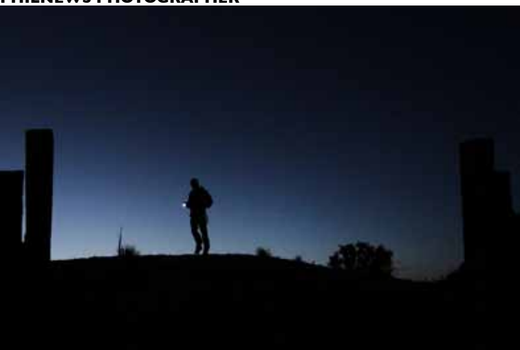
A scout heads back to Philmont Base Camp after the opening campfire on Saturday, June 9, at the Opening Campfire pit.