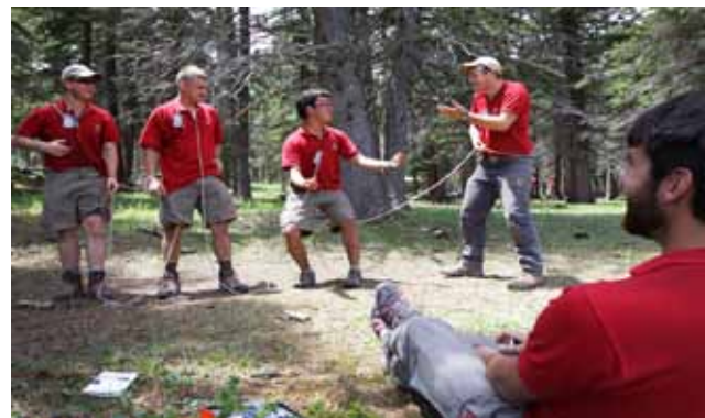
Rangers recite the Ranger song while playing a team-building game at Ranger Rendezvous. The rendezvous is the final step before Ranger Certification.