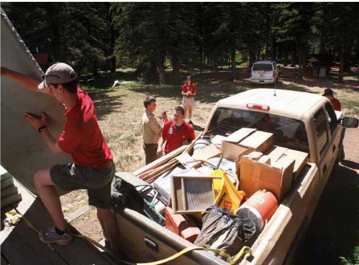
Staff members unload a truck during Phillip's Junction scatter on Wednesday, June 6.

After days of long training sessions, Scatter is the first sign that the season is getting underway.