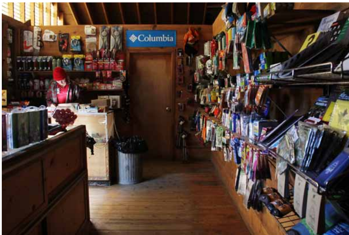
Phillip's Junction Trading Post provides Scouts with any items they might need while on the trail.