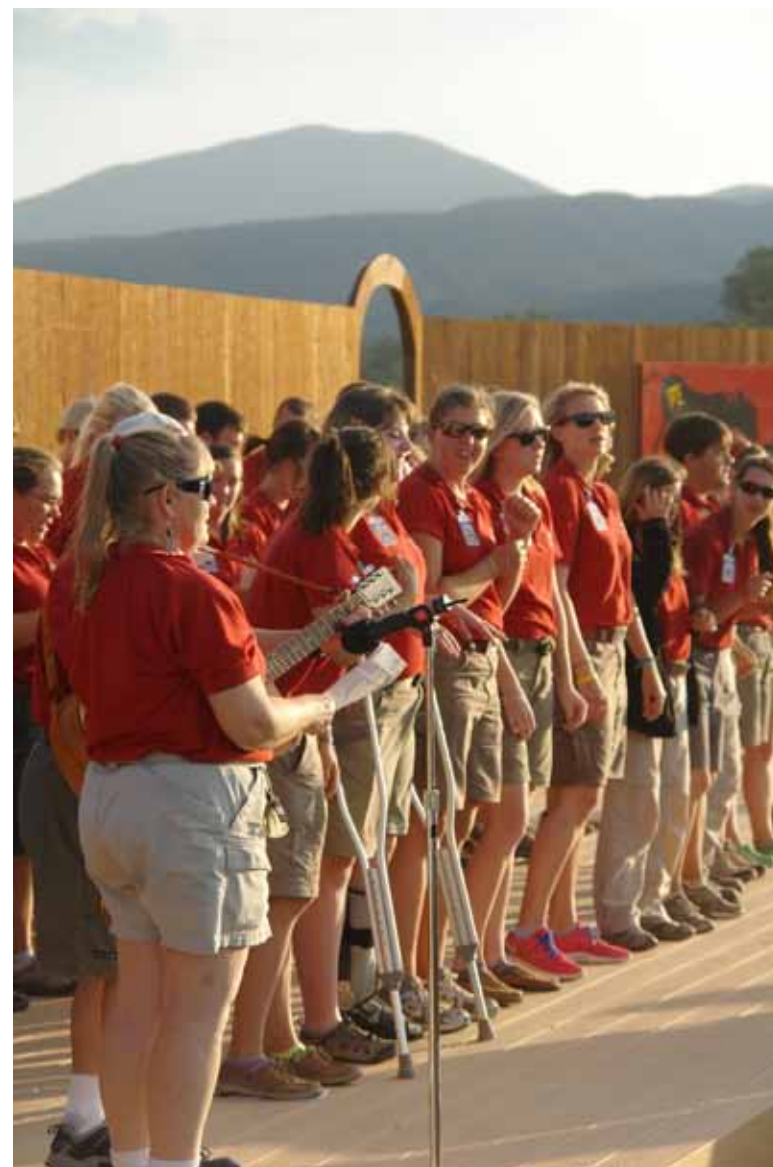
PTC Closing Campfire.