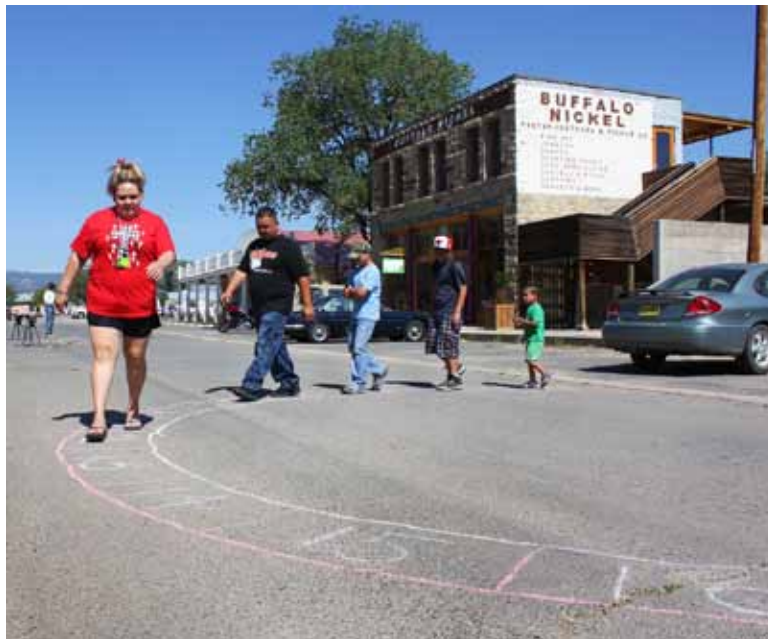
Guests of Cimarron Days participate in a cake walk. The baked goods were provided by Cimarron residents.