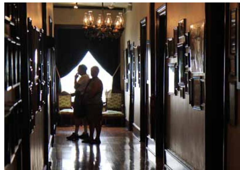
Visitors peruse the historic artifacts on the walls of the St. James Hotel on Saturday, June 23, 2012.

A tarnished bronze register sits at the front desk of the St. James Hotel, a $5.01 still tallied on the display from the last fingers that punched them in. Nearby is the more modern and functioning one worked by the receptionist.