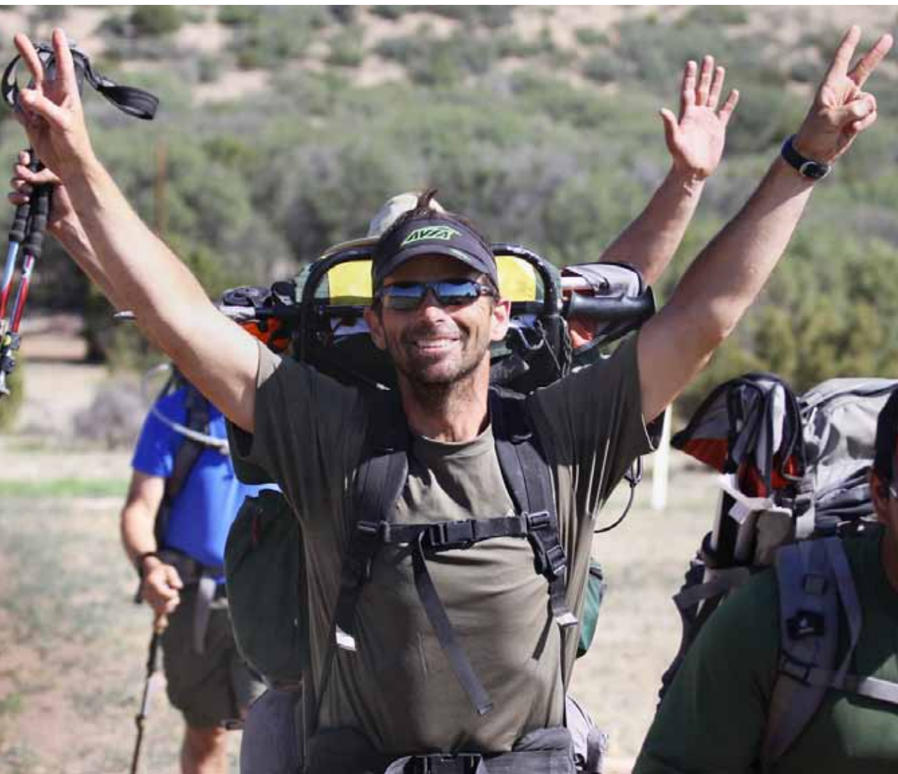
The first crews of summer 2012 return to base camp on Tuesday, June 19.