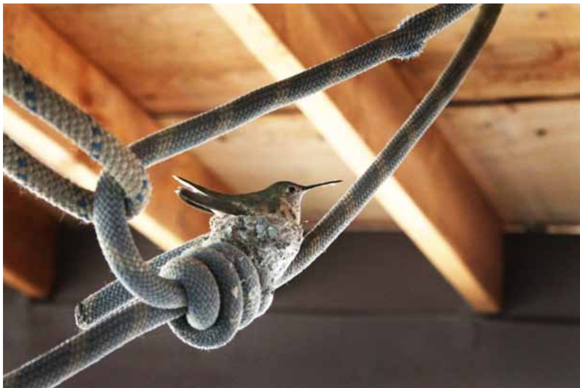
A female black-chinned hummingbird sits on her nest on Monday, June 11 at Head of Dean camp.