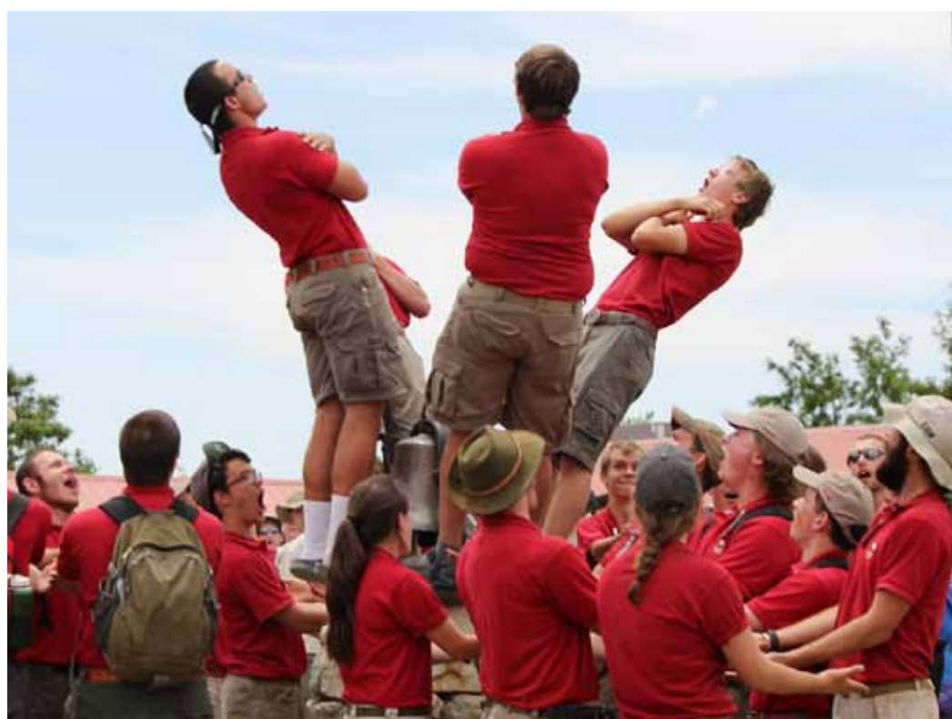
Before lunch, rangers get Scouts excited about Philmont with a story and a trust exercise.