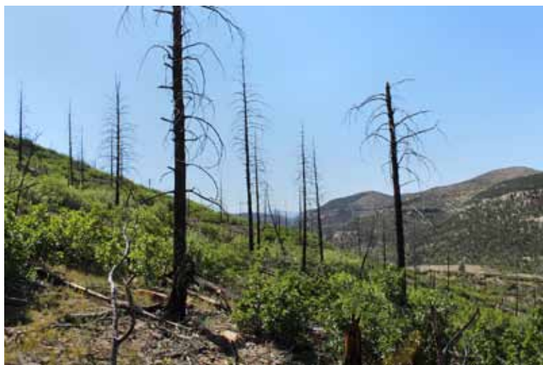
It has been ten years since the Ponil Complex Fire burned 92,500 acres of land.

Stuever thinks that a healthy forest is more resilient to the