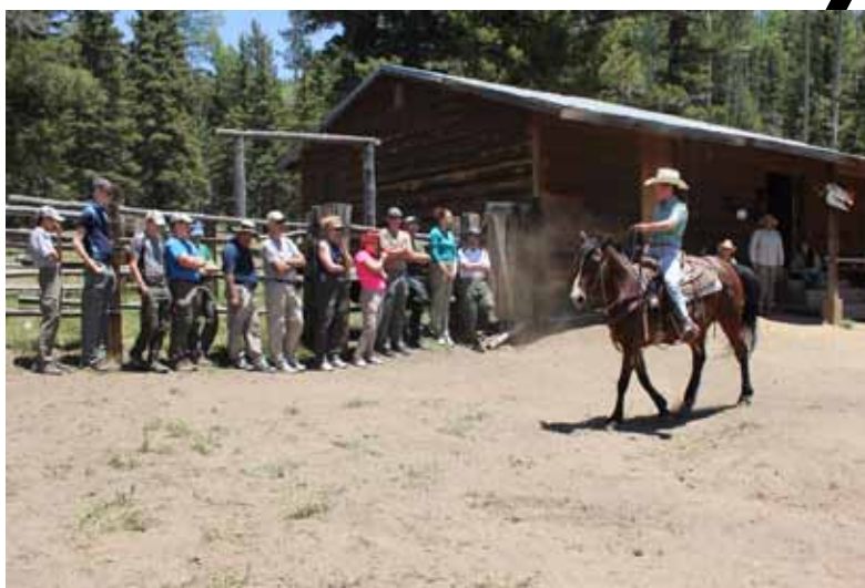
Before a trail ride, wranglers demonstrate the basics of mounting and riding a horse.

Wranglers coach participants through the basics of horseback riding in the corral before the ride begins. They help participants learn how to mount their horses, steer using reins, and monitor the behavior of the horses on the