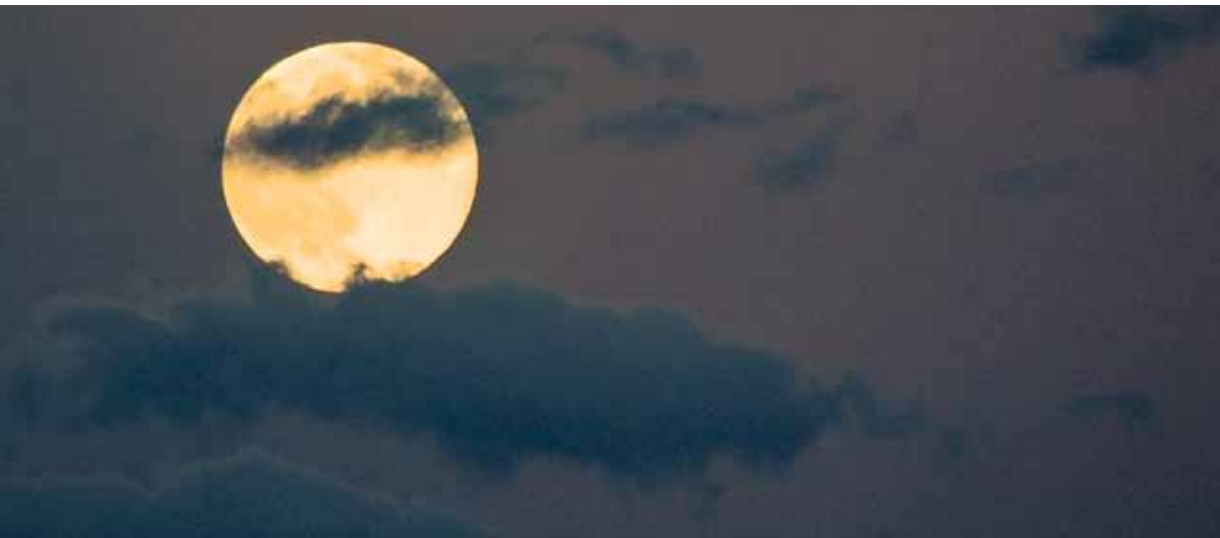
The moon rises over base camp on Wednesday, August 1.6