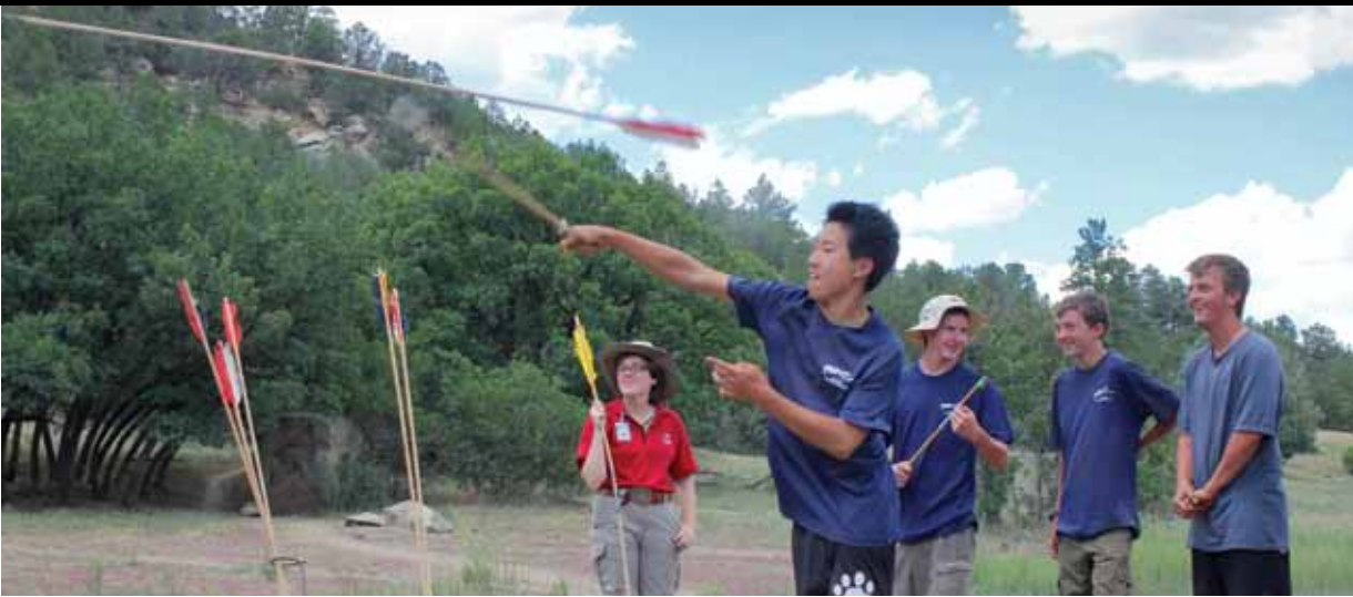
Scouts throw spears at targets using atl-atls on Wednesday, August 1 at Indian Writings. Atl-atls are tools that use leverage to increase the velocity at which a spear can be thrown.