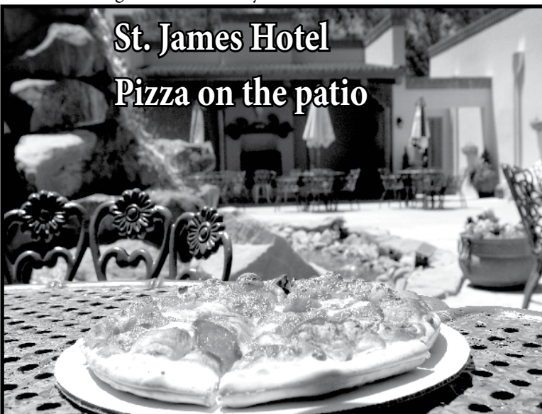
St. James Hotel Pizza on the patio