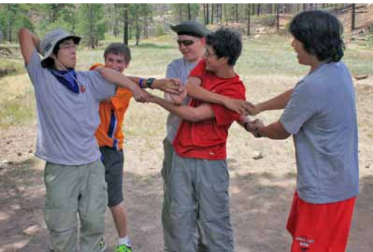
Crew 730-TI participates in the human knot, one of many group challenge activities on Wednesday, August 1 at Dan Beard.

The program at Dan Beard is a challenge course. Crews warm up by playing a few different games such as Yonk. Yonk is a game that makes you say Yonk to the person next to you in funny