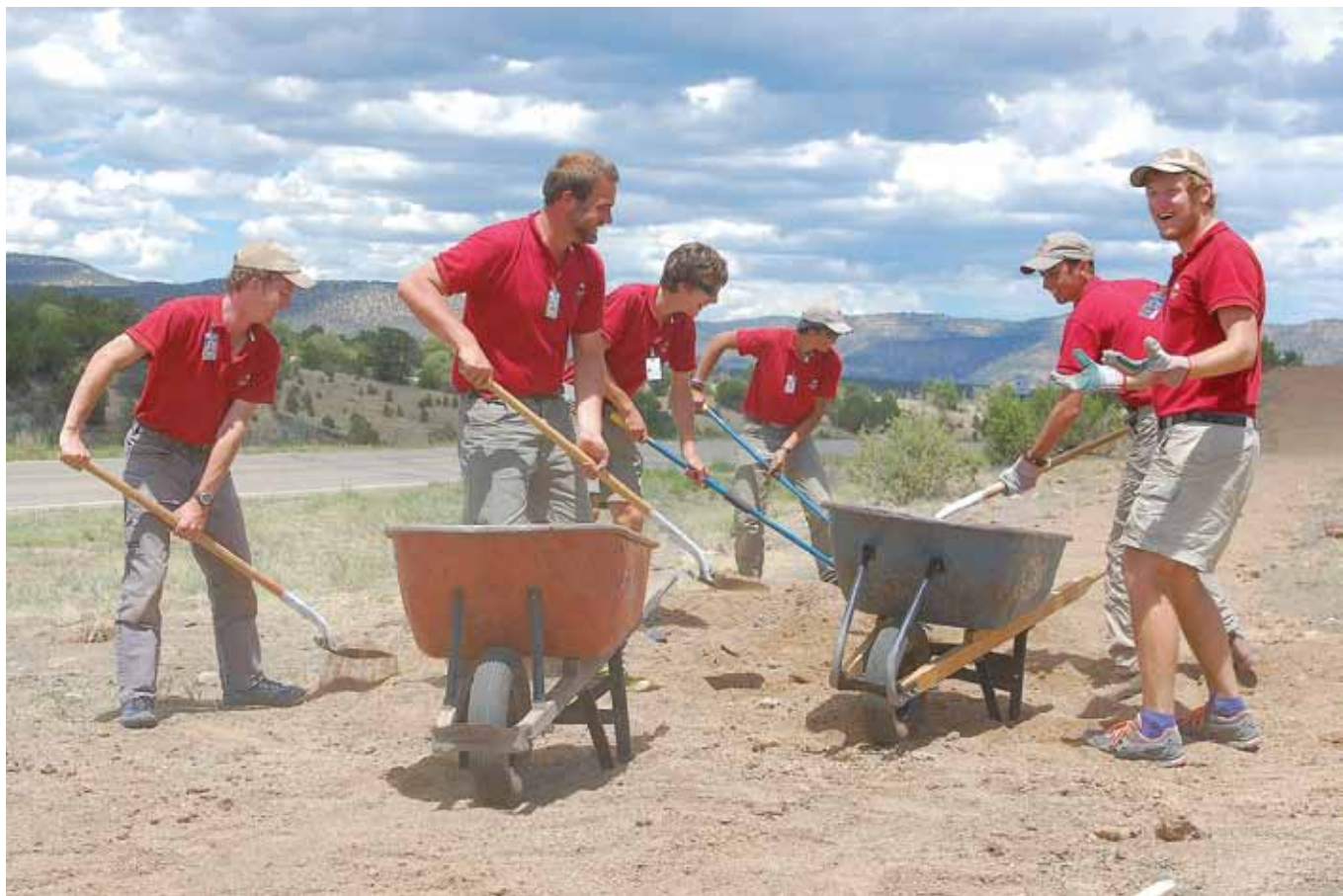
Rangers build the trail to Cimarron as part of a work day on Thursday, August 2.