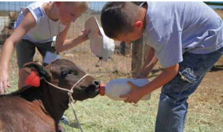
Children feed a calf on Friday, June 15 at the PTC petting zoo.

One of the most exciting activities for the children of Philmont Training Center (PTC) participants is the petting zoo. Located east of the Handicraft Lodge, just past the campfire ring is the pony pasture. Here, kids have the opportunity to interact with a variety of different farm animals.