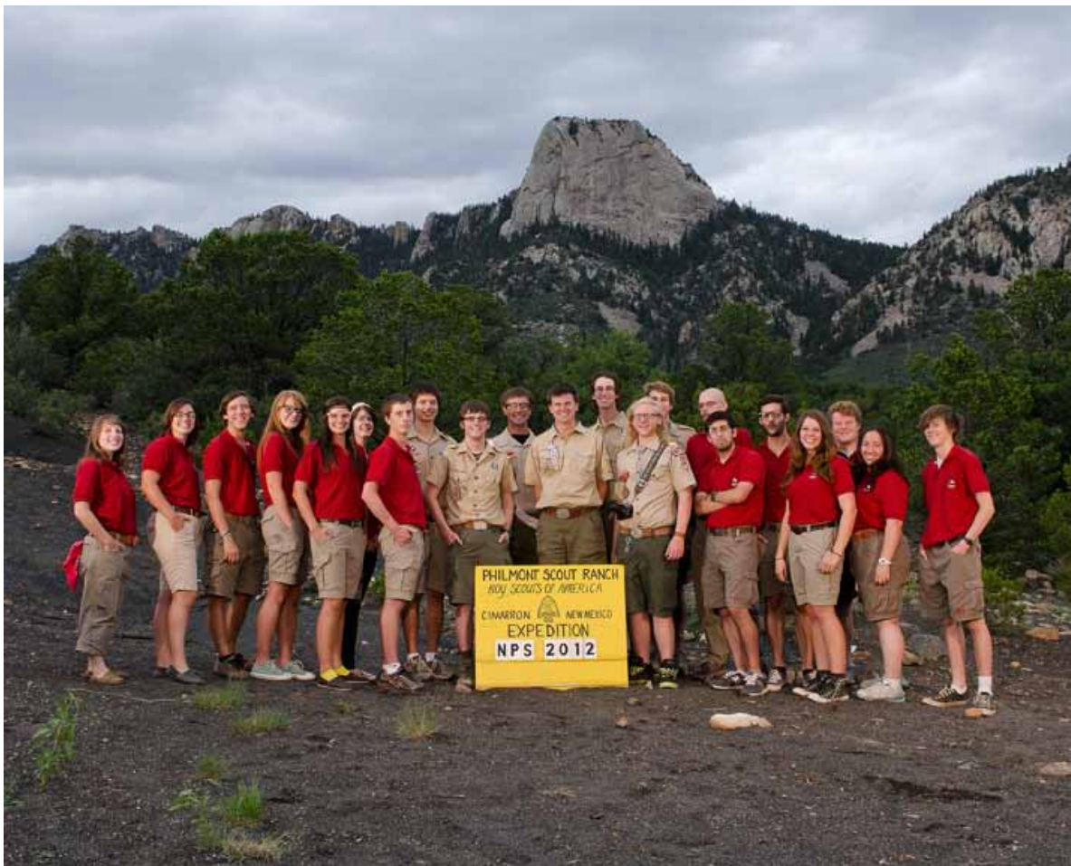
News and Photo Staff.