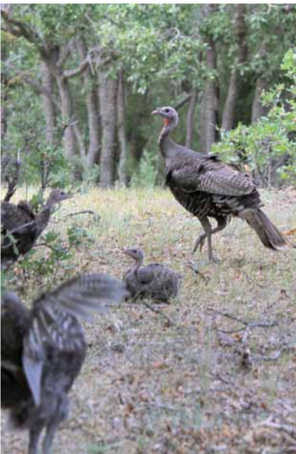
A family of turkeys feeds on Monday, July 30 near the Lovers Leap turnaround.