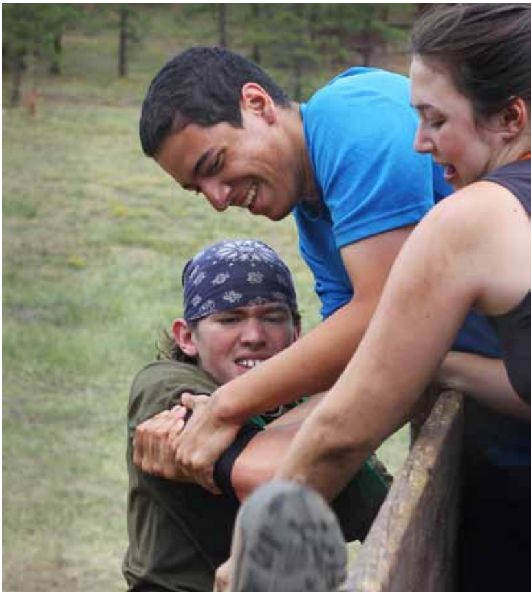
Participants pull a crew member over a wall on Friday, August 3 at Head of Dean.

One of the premiere focuses at Philmont Scout Ranch is turning crews into teams. Through the rugged expanse of mountains and trails, participants learn how to work together and forge new bonds—at one backcountry camp, Head of Dean, those exercises come to the front.