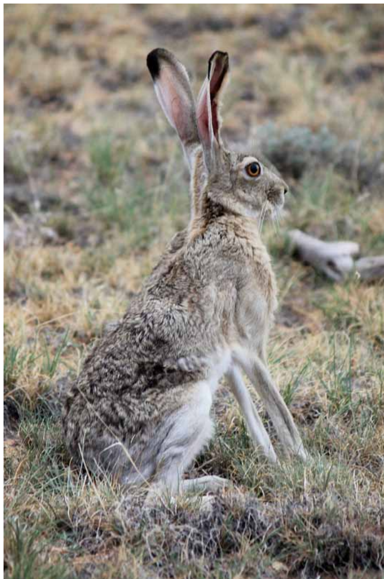
A jackrabbit keeps an eye out for predators while searching for food on the evening of Wednesday, July 25 on the frisbee golf course.

They have a stable population and are in no way threatened, though it is important to be respectful of their habitat, as that is the main cause of most species becoming endangered.