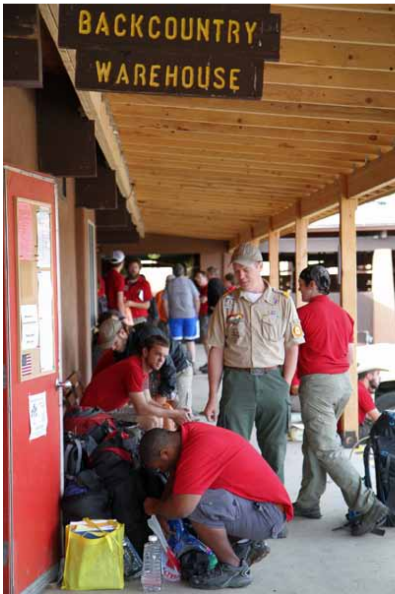
Backcountry staff members wait for rides back to their camps on Sunday, August 5 at the Backcountry Warehouse.