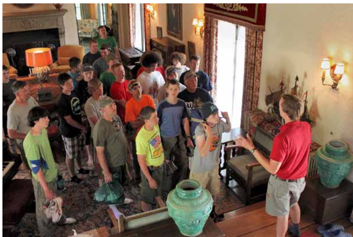
Scouts tour the Villa Philmonte on Friday, July 20. Each of the tour guides give five to six tours a day.

"I love when Scouts learn and recognize the generosity of Waite and Genevieve," said Byam.